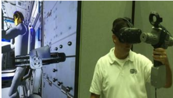
Figure 2. NASA's HR lab showing a user viewing a photorealistic pistol grip tool (PGT) inside an HTC Vive headset, while manipulating a 3D printed PGT that allows for physical feedback.

with handheld instruments such as the pistol grip tool (PGT).